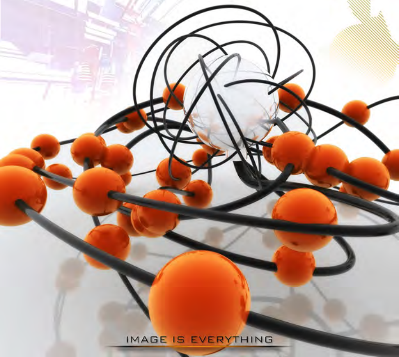
IMAGE IS EVERYTHING